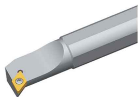
Right hand style